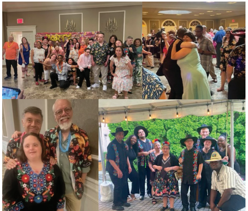
Happy people celebrating at the Summer Fiesta!

The entire GEC community came together at Gargiulo's Restaurant in Coney Island on June 25th to kick off the summer in style with a dinner-dance, Fiesta style. The adults we support in our Residential and Day Habilitation programs, along with staff and family members, came dressed up and ready to party! DJ Tom Hoeful provided constant fun and music for dancing (something our folks love to do) and the Hoeful family donated a special ice cream sundae station as an added treat. This was not a fundraiser, but rather a heartfelt sharing of happiness and love for each other...an oasis of kindness, and everyone had a great time!