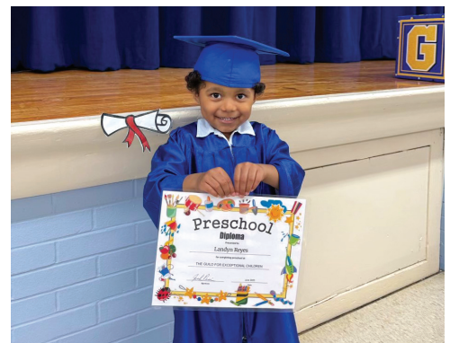
A happy graduate